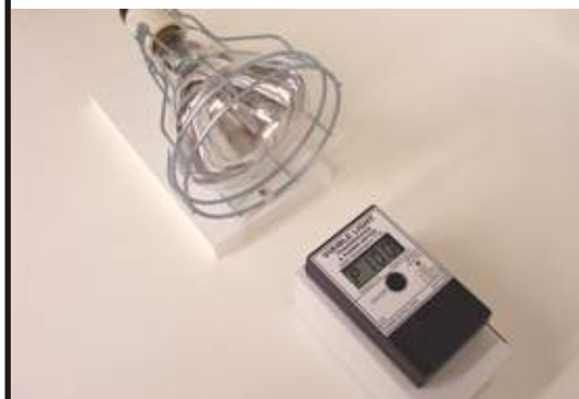
← STEPS 2, 3 & 4

To set up a dynamic TABLETOP PRESENTATION , or to perform readings in a bench-type QC application, place a light source facing the VP1165. The light source should be stable and held in position so it cannot move during the measurements. Position the meter flat on the table with the sensor facing the light source directly. If necessary, place the VP1165 on top of its box to position the meter in the center of the light beam. To obtain the most accurate results, DO NOT move the light source or the meter during the readings. To take transmission measurements (VLT), follow the same format described under automotive glass on the previous page. Instead of opening the window, simply perform Step 2 by setting up the lamp and meter as shown in the picture below. After you have completed Step 4 (self-calibrate), you can begin sliding samples of glass or film between the lamp and meter. The resulting Visible Light Transmittance (VLT) will be displayed on the meter (See STEP 5 below).