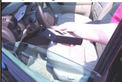
← STEPS 2, 3 & 4